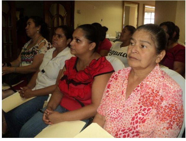
One of the women's groups that is working on developing the security agenda in Honduras.

ZISVAW Safe City - Tegucigalpa, Honduras | Women's Security Agenda